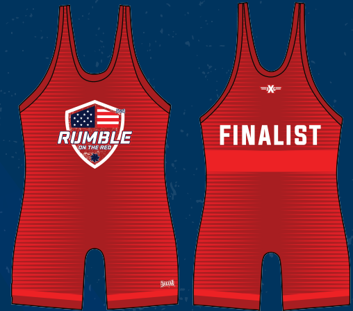
RUMBLE INDIVIDUAL FINALIST AWARDS

Register before Dec 10th, 2021 $30 Register Dec 11th - 28th, 2021 $40 Register Dec 29th - 30th, 2021 $50 *No Walk ups on Dec 31st, 2021*