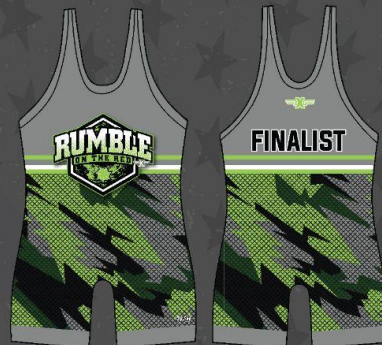
RUMBLE INDIVIDUAL FINALIST AWARDS

Register before Dec 9th, 2023 $35 Register Dec 10th - 27th, 2023 $45 Register Dec 28th - 29th, 2023 $60 *No Walk ups on Dec 30th, 2023*